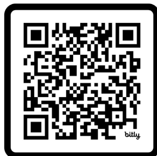
PTO Facebook Page